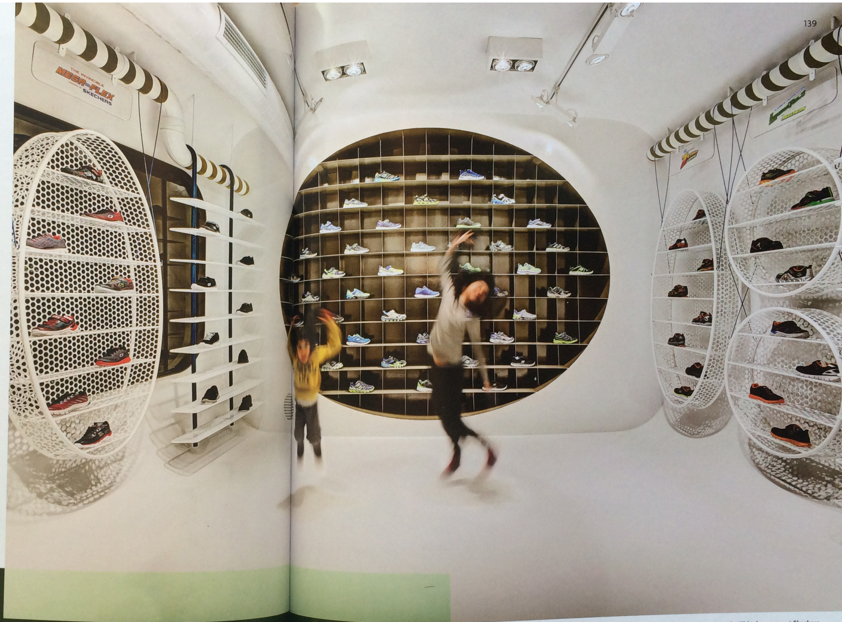
In the Kids showroom at Skechers Istanbul, Zemberek evoked sweets, Ferris wheels and playtime.